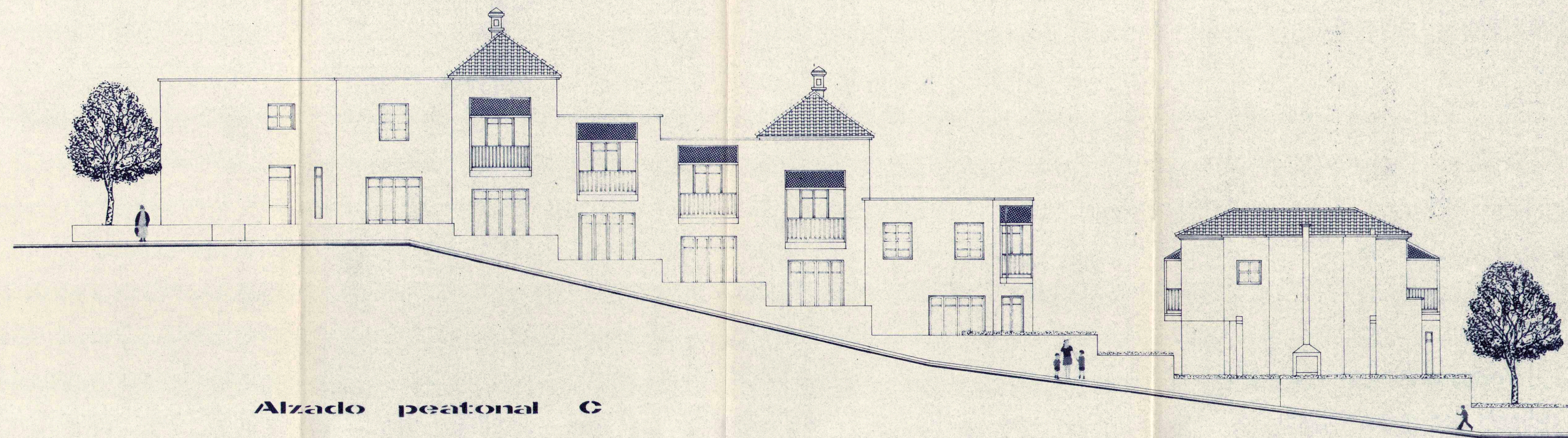
Alzado peatonal C